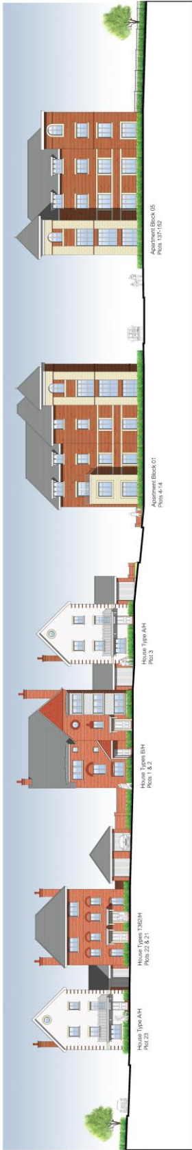
Street Scene 01